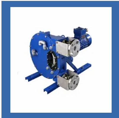
Peristaltic Hose Pumps