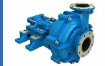
Heavy Duty Slurry Pumps