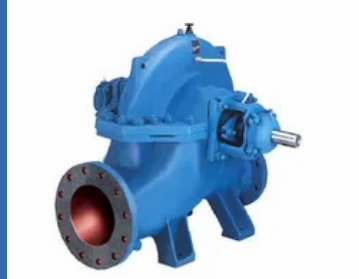
Split Casing Pumps