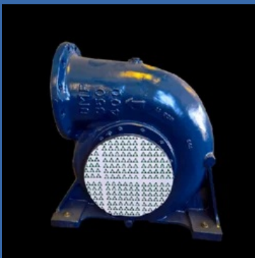
Mixed Flow Pumps