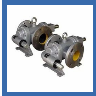
Hydraulic Gear Pump