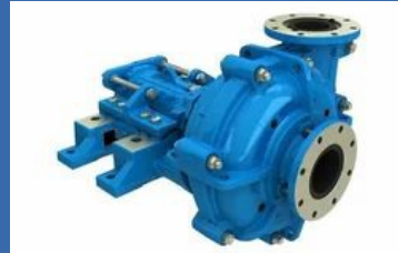
Heavy Duty Slurry Pumps