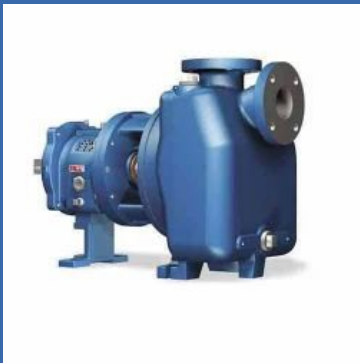
Self Priming Pumps