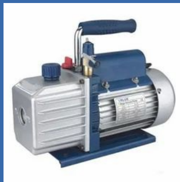
Oil Sealed Vacuum Pumps