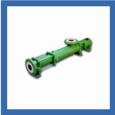
Industrial Screw Pumps