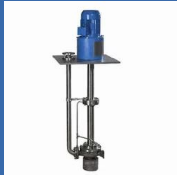
Vertical Submerged Pumps