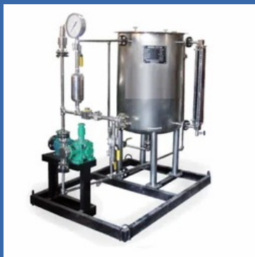
Skid Mounted Dosing System