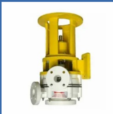
Vertical Glandless and Sealless Pumps