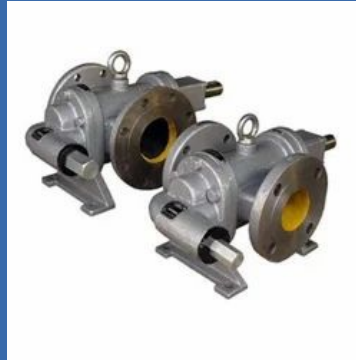
Hydraulic Gear Pump