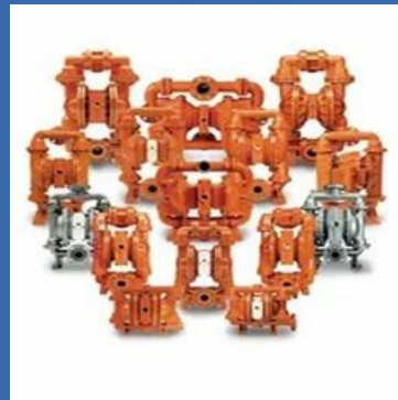
AODD Pumps - Wilden