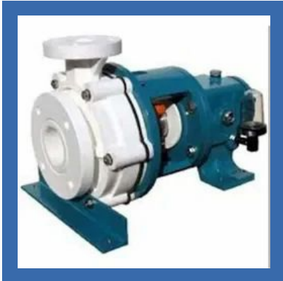
Industrial Centrifugal Pumps