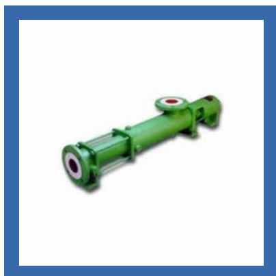
Industrial Screw Pumps