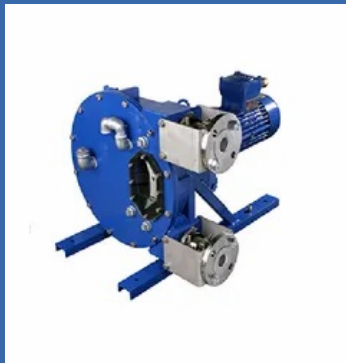
Peristaltic Hose Pumps