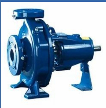
Metallic Centrifugal Pumps