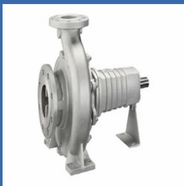
Pumps for Chemical Industry