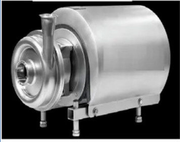
Sanitary Centrifugal Pumps