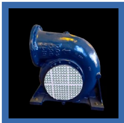
Mixed Flow Pumps