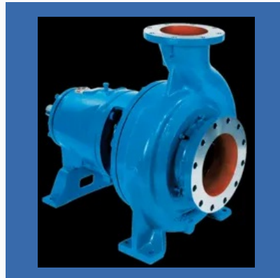
Pulp Stock Pumps