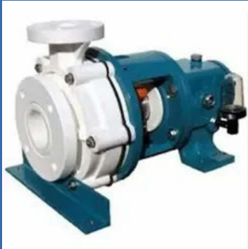
Industrial Centrifugal Pumps