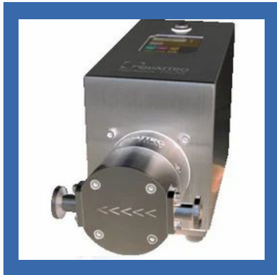
Electric Diaphragm Pump