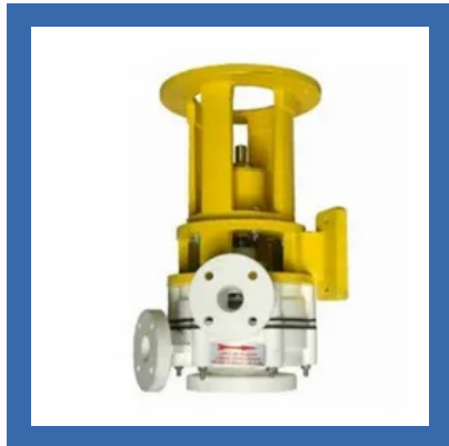
Vertical Glandless and Sealless Pumps