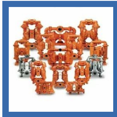
AODD Pumps - Wilden