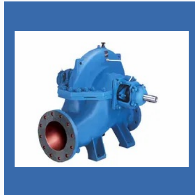
Split Casing Pumps