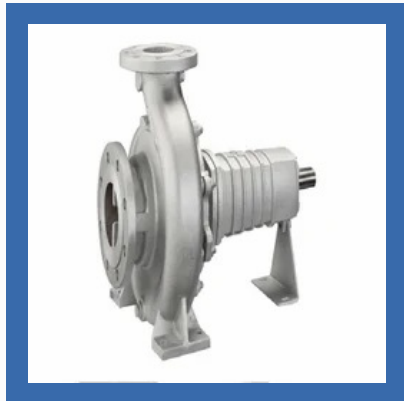
Pumps for Chemical Industry