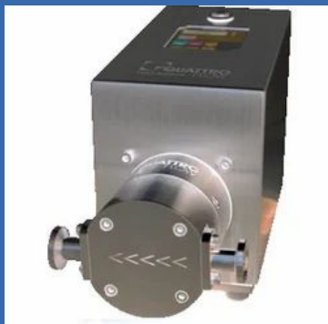
Electric Diaphragm Pump