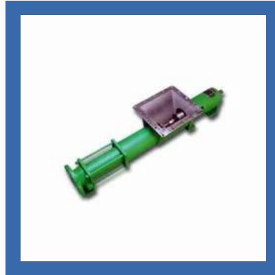
Wide Throat Screw Pumps