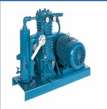
Blackmer Liquified Gas Compressors