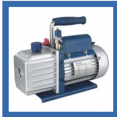
Oil Sealed Vacuum Pumps