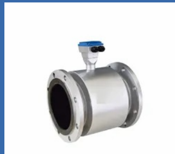
Flow Meters for Steel Industry