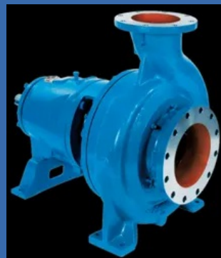
Pulp Stock Pumps