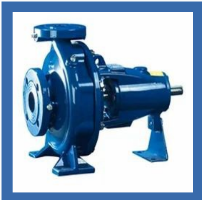
Metallic Centrifugal Pumps