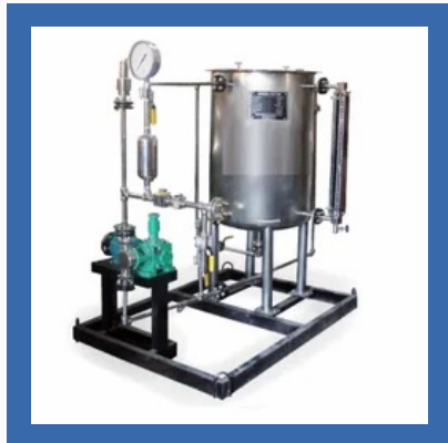
Skid Mounted Dosing System