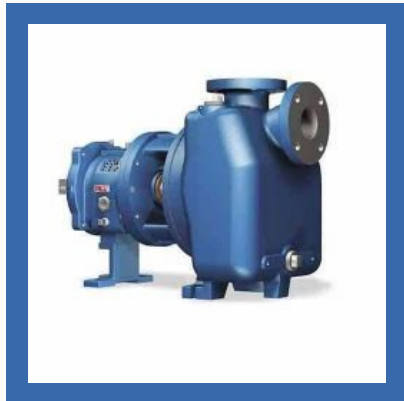
Self Priming Pumps