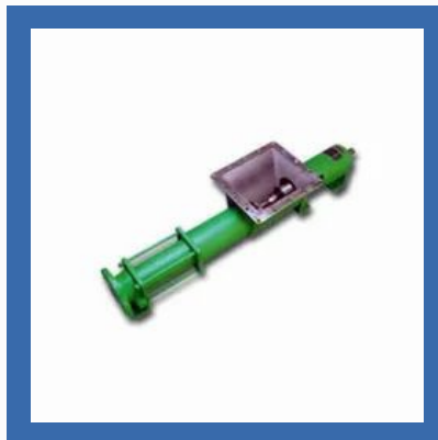
Wide Throat Screw Pumps