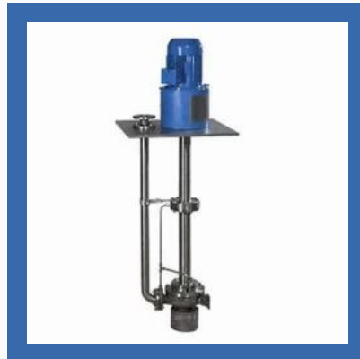
Vertical Submerged Pumps